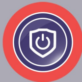
Waterproof mechanical switch