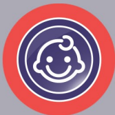
Child safety door