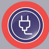
Sufficient hole interval