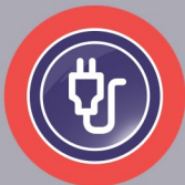
Thickened power core